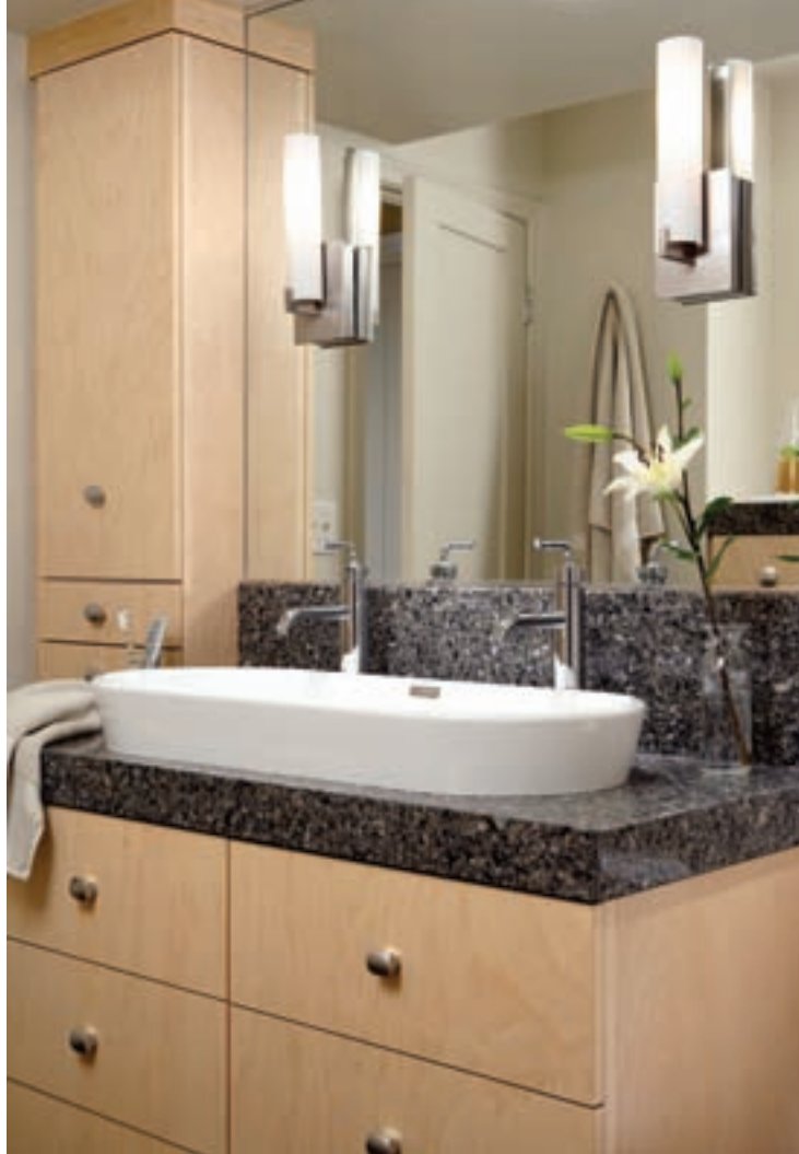
"It's spa-like and, like, relaxing," says the 13-year-old girl of her new bathroom.